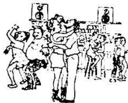
Figure 3 is a picture that shows risky behaviours. Use it to answer question 19.