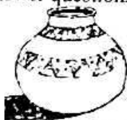
Figure 1 shows an artwork. Study it and use it to answer questions 3 and 4.