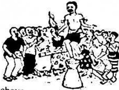
Figure 4 is a traditional dance, use it to answer question 32.c.