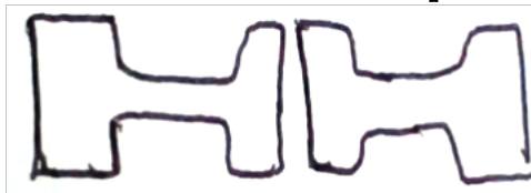
Figure below is a diagram of musical instrument. use it to answer question 32 and 33