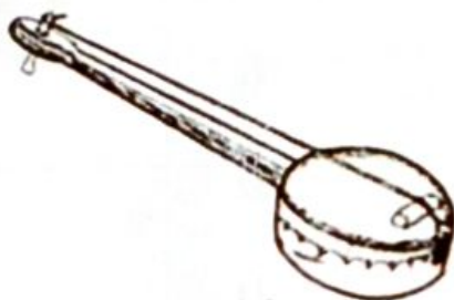
Figure 1 is a diagram showing a musical instrument. Use it to answer questions 4 and 5.