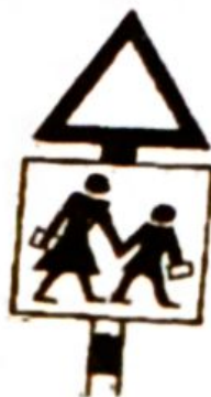
Figure 3 is an illustration showing means of communication.

32. a. (i) What is the meaning of the sign? (1 mark)