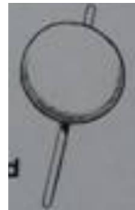
Figure 1 is an artistic activity. Use it to answer questions 7 and 8 .