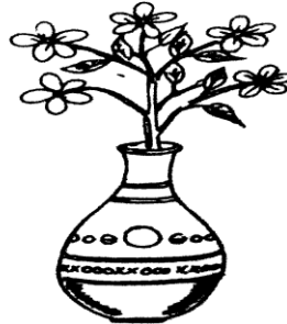
Figure 3 is a diagram of an item produced through artwork. Use it to answer questions below: