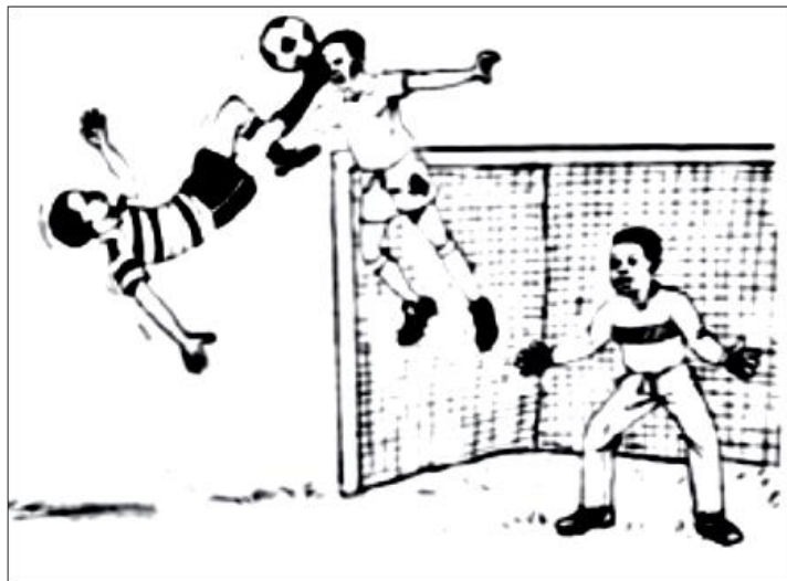
Figure 2 is a diagram that shows a source of risks in sports. Use it to answer questions that follow:

c i) Identify the source of risk. _____ (1 mark)