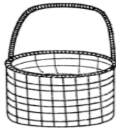
Figure 1 shows an artistic item use it to answer question 5 and 6.