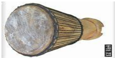
Figure 1 Shows one of the musical instrument. Use it to answer the question 4 and 5.