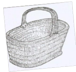
Figure 1 is a diagram showing an artwork. Use it to answer questions 7 and 8